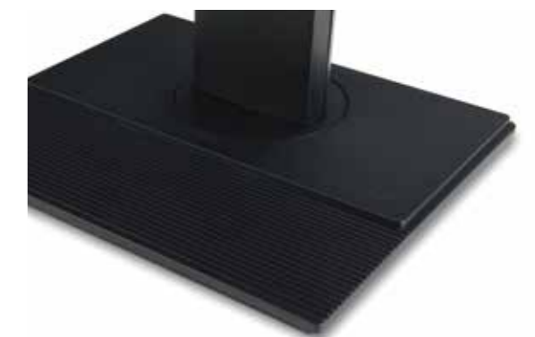
MAGNETIC BASE, WITH MODERN DESIGN, TIDIES UP PAPERCLIPS